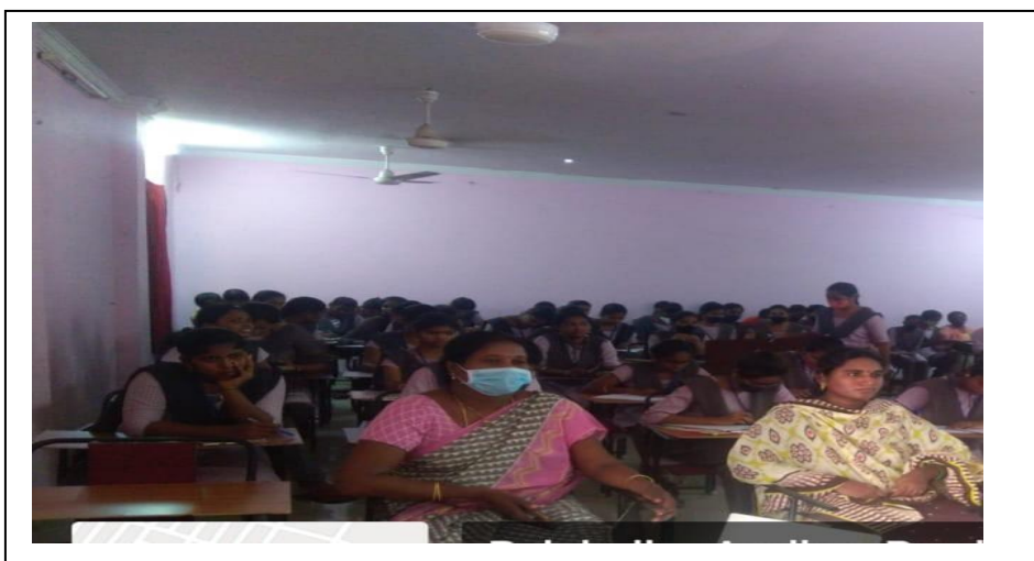
Counseling Programme on Safety and Security: 05-01-2022