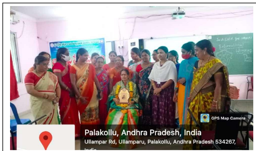
International women's day: 8-3-2022