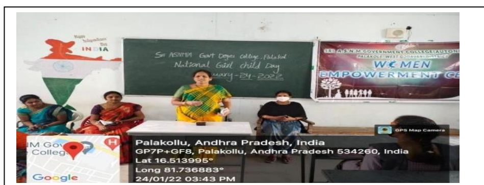
National Girl Child Day: 24-01-2022