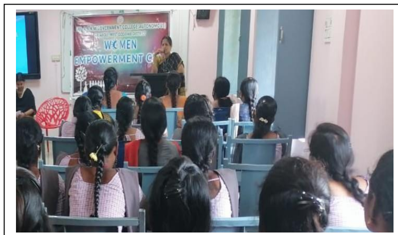
Counseling Programme on Health and Hygienic: 11-08-2022