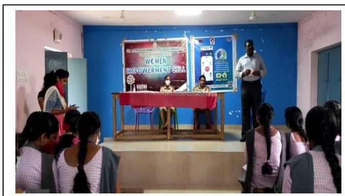
Awareness Programme on DISHA APP: 26-08-2021