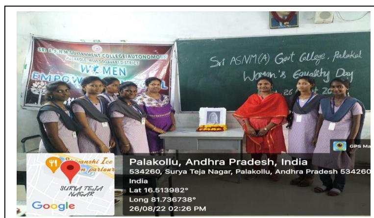
Women's Equality Day: 26-08-2022