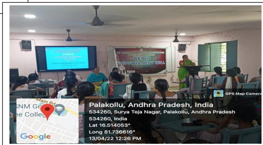
Awareness Programme on DISHA APP: 13-04-2022