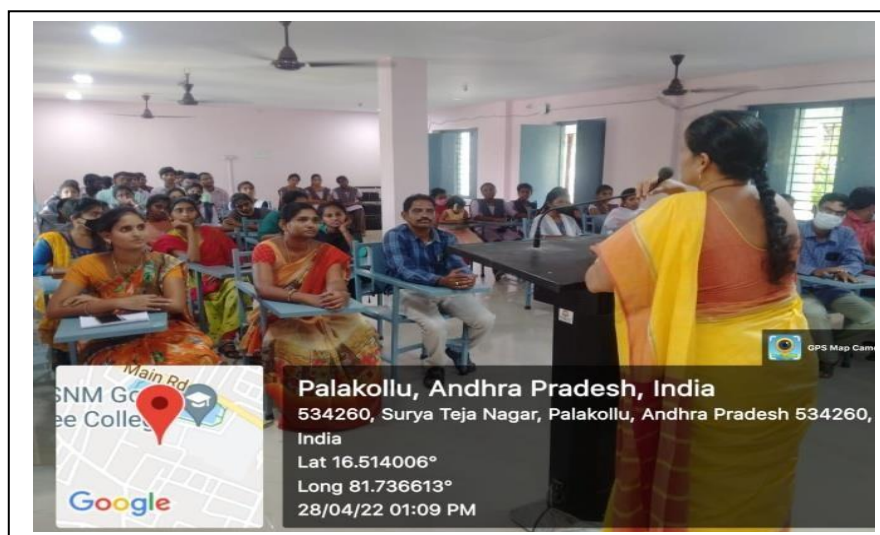
Stop Food Waste Day:28-04-2022